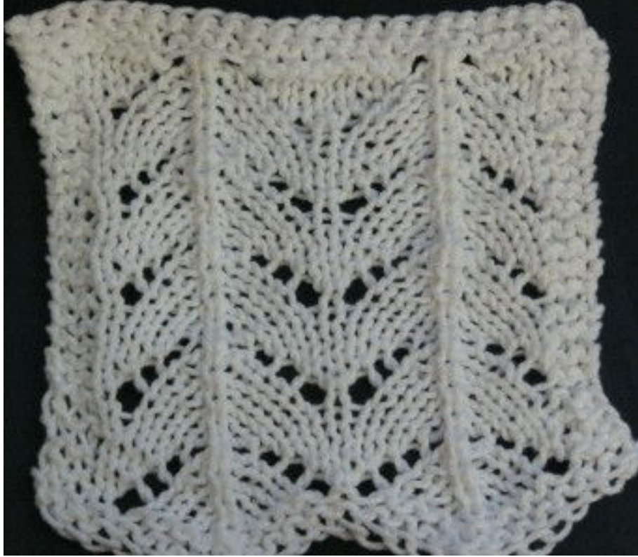
Sample of a two-pattern repeat with garter stitch border. (Actually, in this sample, I did not include the +1 stitch to finish the pattern.)